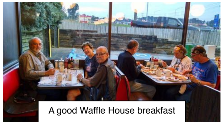
A good Waffle House breakfast