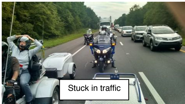
Stuck in traffic