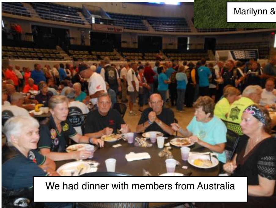
We had dinner with members from Australia