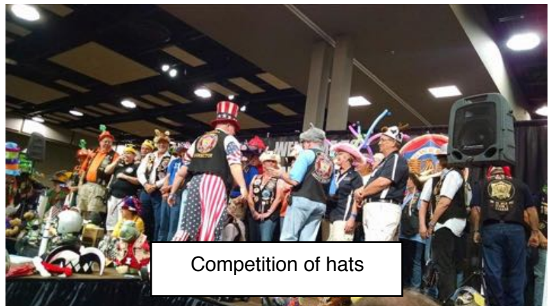
Competition of hats