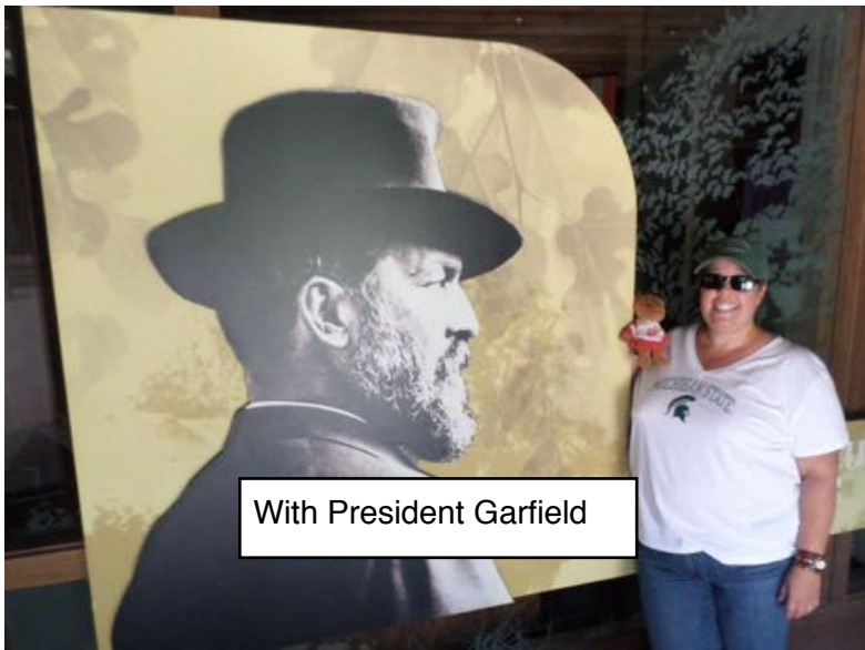
With President Garfield