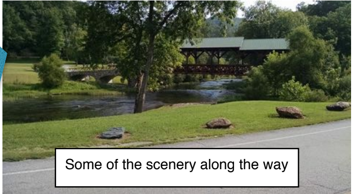
Some of the scenery along the way