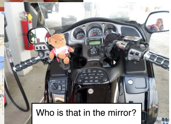
Who is that in the mirror?