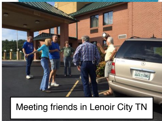
Meeting friends in Lenoir City TN